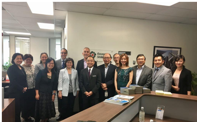
RIBO Seminar and RIBO CEO meet and great – September 14 th