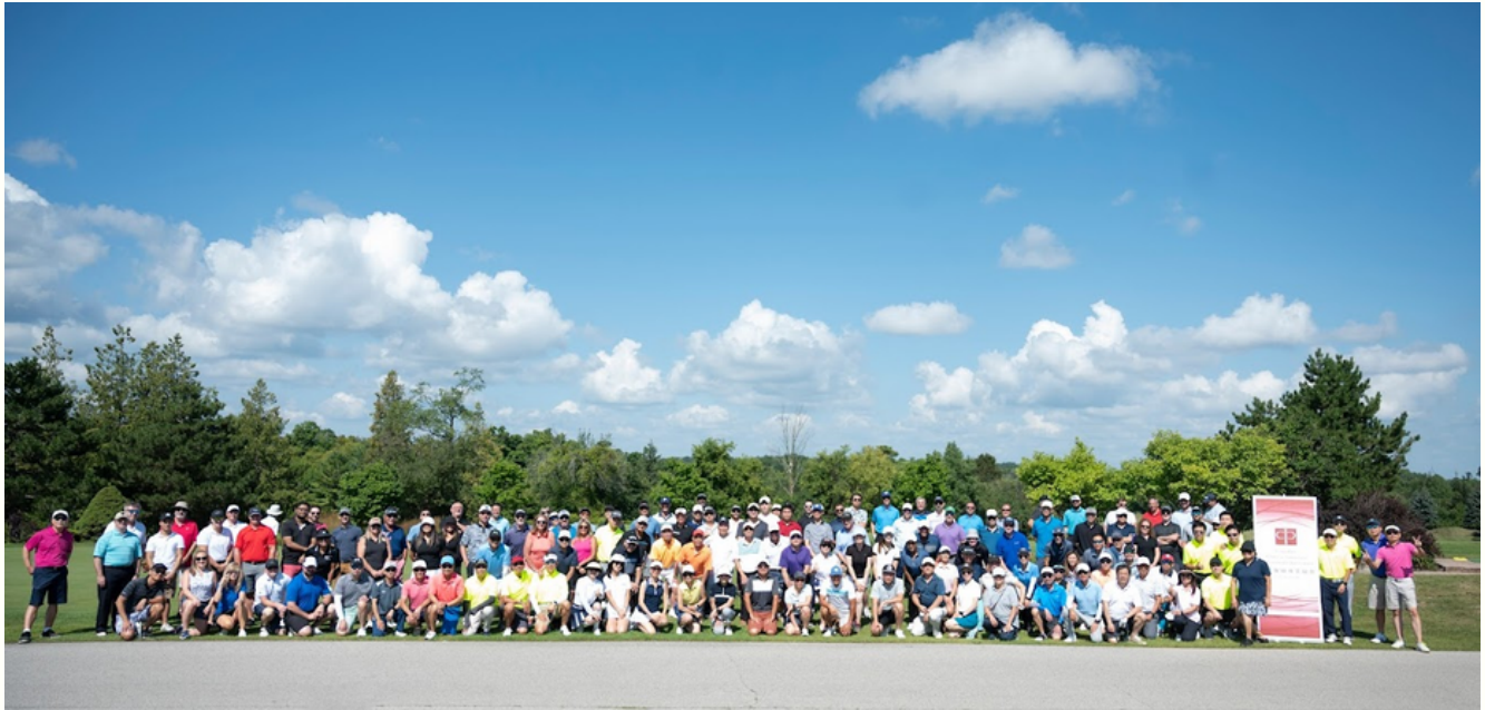
CCIPA CHARITY GOLF EVENT 2022

Canadian Chinese Insurance Professionals Association's Quarterly Newsletter